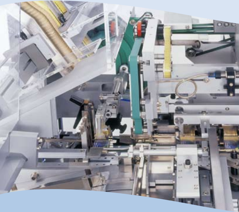
Carton pick-up and product insertion